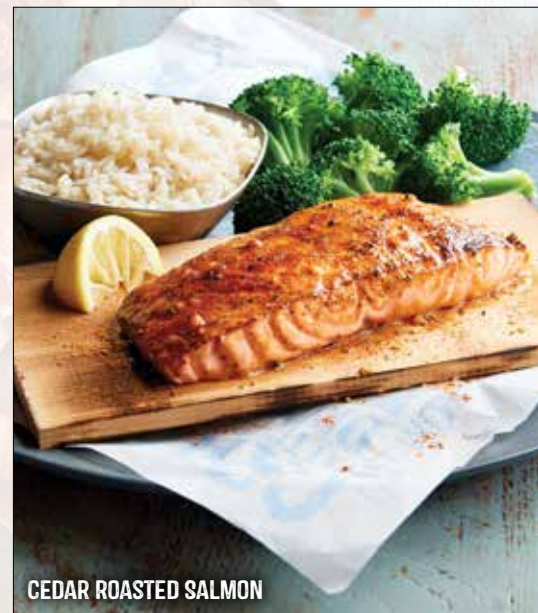
CEDAR ROASTED SALMON

FISHERMAN'S CHOICE* Choice of mahi, salmon or redfish blackened or grilled, over dirty rice and seasonal vegetables 18.79